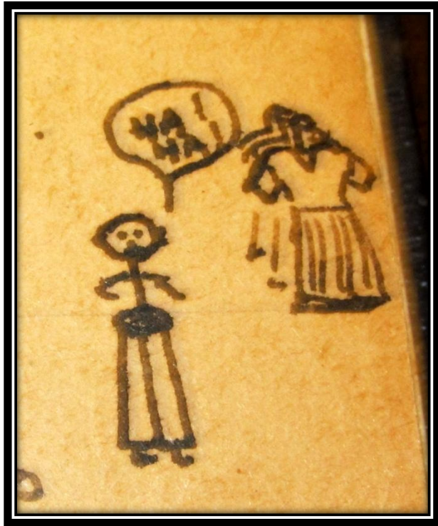
Putting away their dresses. Sketch from the scrapbook.

the boat. That night they sailed into Wesleyville but they were not able to go ashore. According to Mabel, the sea was too rough and foggy so they spent the evening on board.