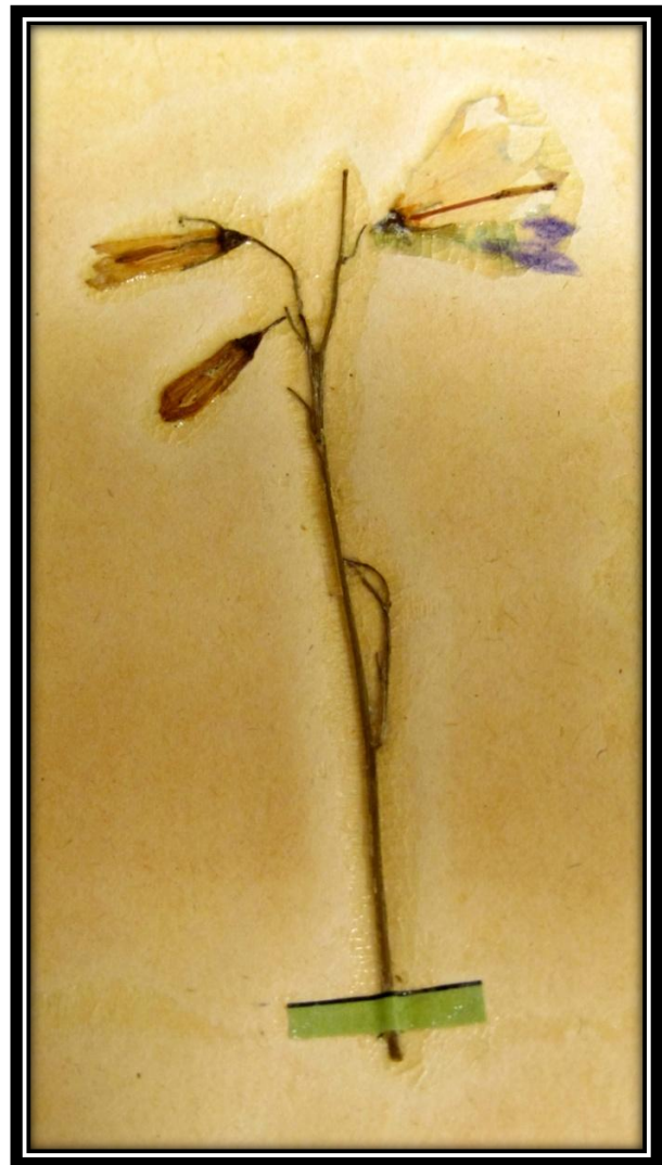
Picked at Twillingate

Around two o'clock, the Kyle arrived in Twillingate where Mabel, Pat and Connie got off to investigate. It was Sunday and all the stores were closed so instead of shopping they took some photos and picked flowers. Soon they were back on board to have lobster for supper and head to bed early. It was a “fairly long hop” to the next stop. By 2AM they had arrived in St. Anthony but the fog kept them from docking. The “water was too deep to anchor so went around in circles until it was clear enough to enter.”